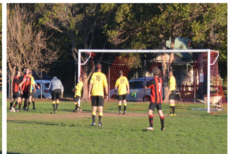
WYONG's second goal