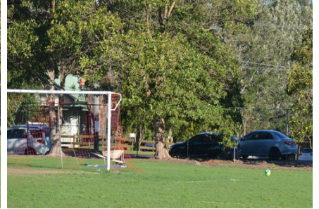
ANDY misses two solid opportunities