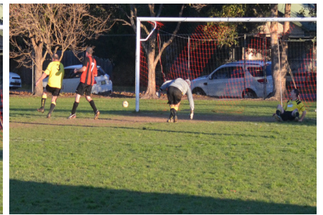
An elbow here, a head-butt there and some good ol' fashion tripping by Wyong's unpunished No. 7