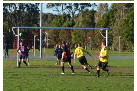
SCOTT's free kick