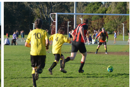
MARKY vs GOLIATH