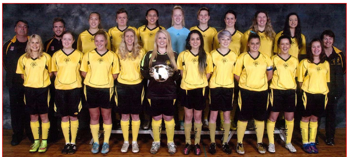
2015 Wyoming FC Women's First Squad