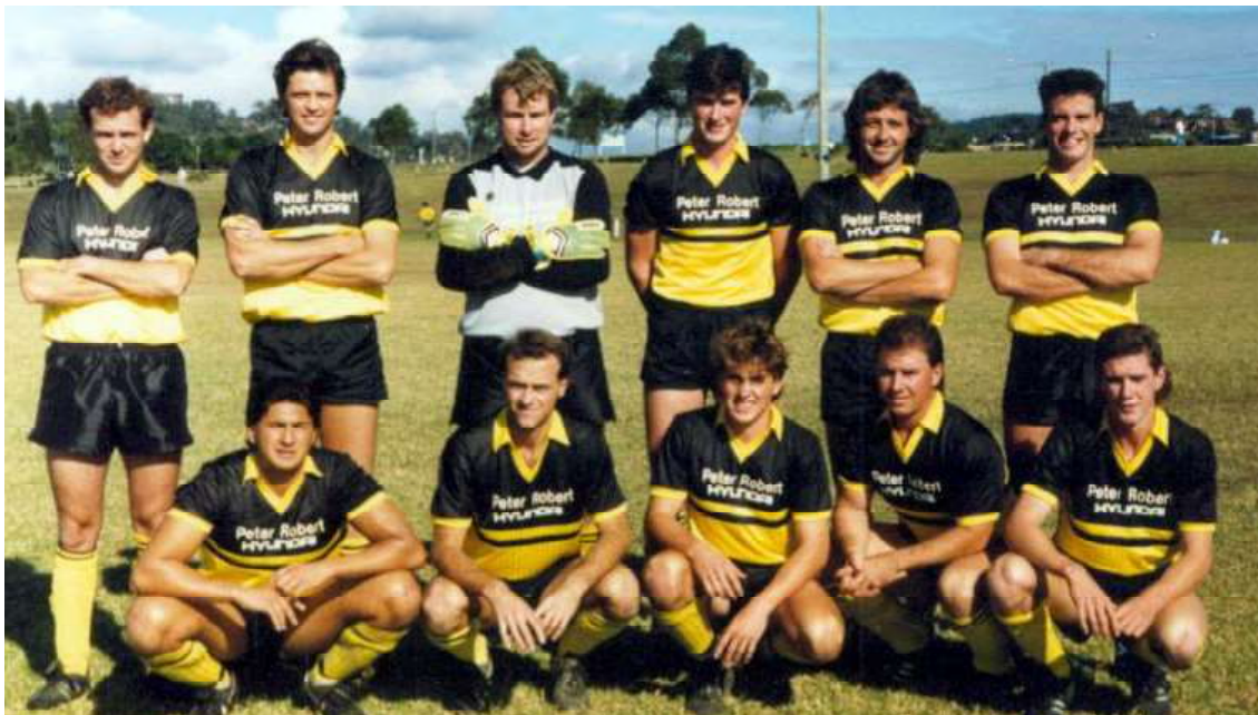
1990 FIRST GRADE - NORTHERN NSW AMATEUR CUP WINNERS

In their first premiership match of the season Wyoming defeated Ourimbah 6-0, and shortly after sprung the upset of the season defeating the strong Southern-Ettalong United team 5-0 in the first round of the Tooheys (Association) Cup. Despite its long period of domination in the 1970s and early 1980s Wyoming hadn't been able to win the Cup - indeed in 2010 it remains the only significant trophy that the club has never won. Having said that, the 1990 team went closer than any team before or since, reaching the Final and holding favourites Umina to nil-all at full-time. Unfortunately the fact that they'd played their semi-final just two days earlier told in extra-time and Umina ran out 2-0 winners after extra-time.