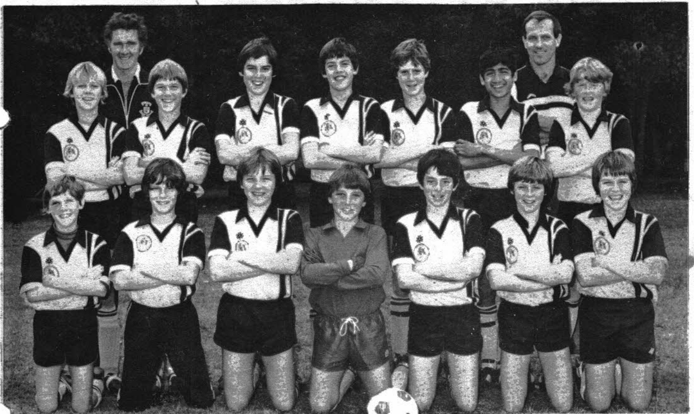
UNDER 13 PREMIERS 1983