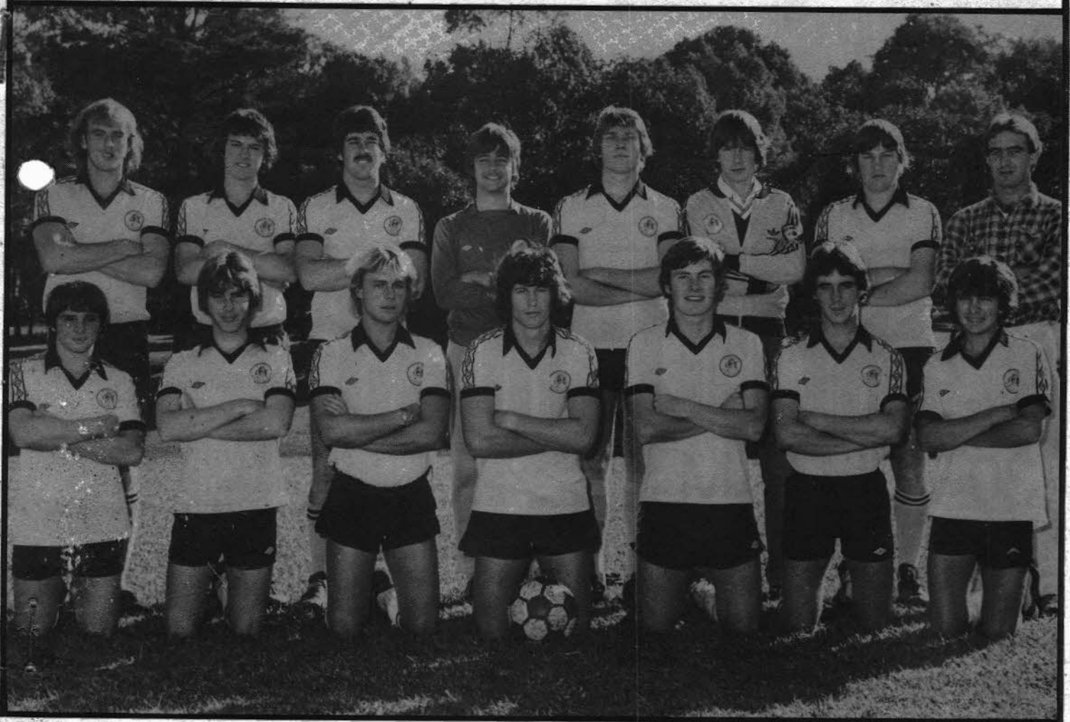
UNDER 19's 1982 PREMIERS