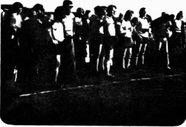
a group of seniors players waiting for the presentation or winning the 1st grade comp.

A Happy New Year to everyone and here's hoping we can drag some money for the club with some K.O. wins this season. For the benefit of our new members, our 1st division 1st grade and second grade were Premiers last year and that meant two in a row for second grade and 3 out of 4 for 1st grade. Our games are played on Sundays starting at 9am for 4th grade continuing through to 1st grade - playing at 2.45pm. Every second week we normally have a home game at Alan Davidson Oval, anyone living around the area will know when the games are on - they will hear the roar of the TIGERS! We have our reputation to defend and anyone who takes it off us will know they have had a game of soccer.